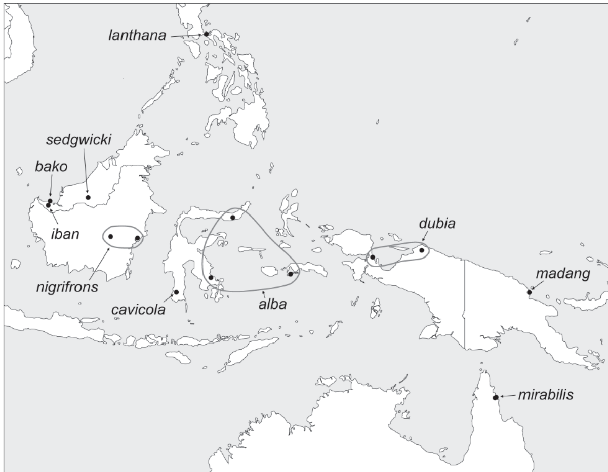
FIG. 435. Known distribution of Panjange .